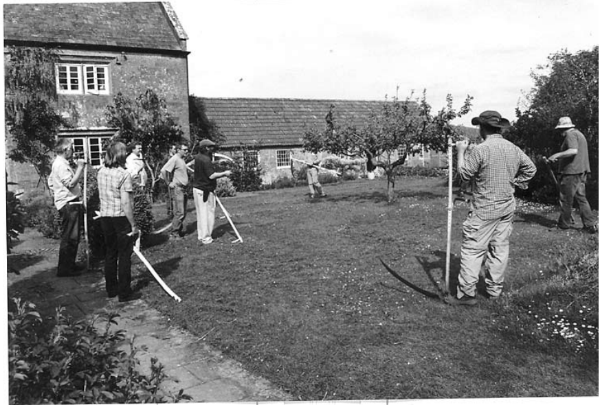
A lawn is an good place to teach beginners the basic action of mowing.

Scythes went out of favour for mowing lawns soon after